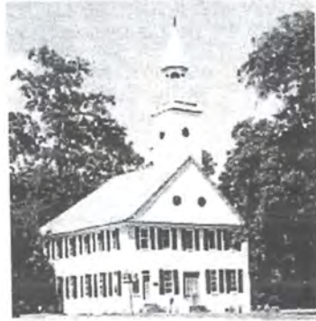
Midway Church, as it stands today.

The stately New England type structure which has stood the rigors of time represents not only a stalwart band of Christians, but patriots of their chosen country. They early supported the move for independence as many of its men played a role in the establishment of the United States of America.